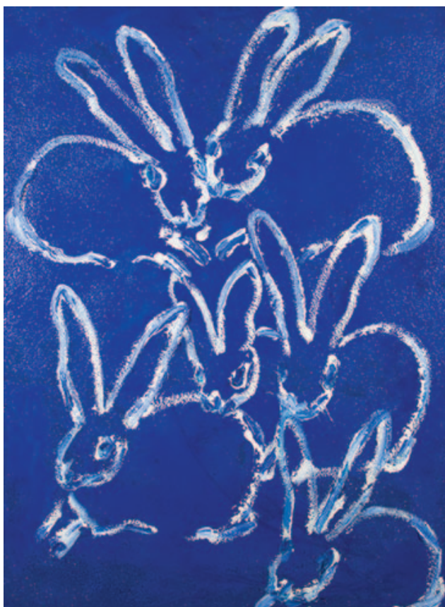
Hunt Slonem, 3 Diamond Dust Bunnies , Oil and diamond dust on canvas, 40 x 30 in., 2015. Vered Gallery.

Henry Geldzahler, former curator of Contemporary American Painting at the Metropolitan Museum of Art, recogniz-