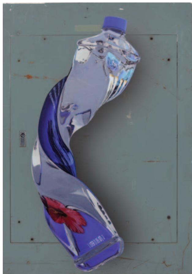
Yung Jake, New Fiji Bottle (Winged) , vinyl wrap on found metal, 36 x 26 x 2 in., 2015. Courtesy of the artist and Steve Turner, Los Angeles/Tripoli Gallery, Southampton and East Hampton; Photo by Wild Don Lewis.

exhibitions simultaneously, it makes for an exciting, non-stop season!